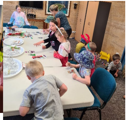
School Holiday Activities.