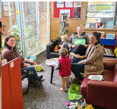
Wellstead Book Club.