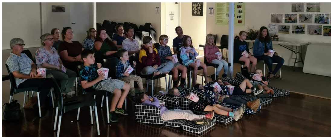
Black Cockatoo Crisis screening at Wellstead Hall.