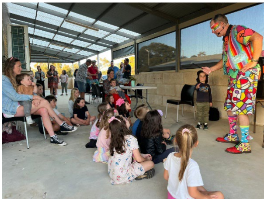
Wellstead's annual Pre-Harvest Sundowner event.